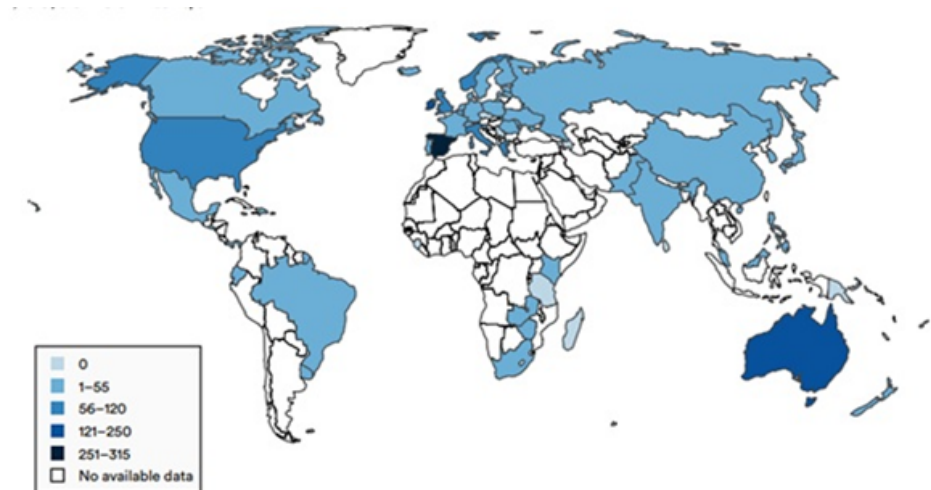
Figure 2. Mentions of AI in legislative procedures by country, 2024.