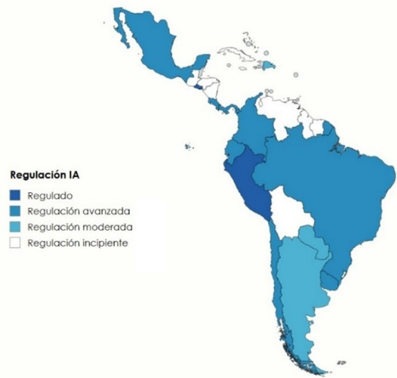
Figure 3. Latin American countries with draft laws on AI.

In Latin America, the most active countries were Mexico, Brazil, Colombia, and Peru, which appear in the medium to high categories of the chart (between 56 and 250 mentions), reflecting a significant regional effort to advance AI governance, despite the regulatory gap with global leaders [25]. Figure 3 shows a map representation of Latin American countries with AI laws and draft bills on AI regulation.