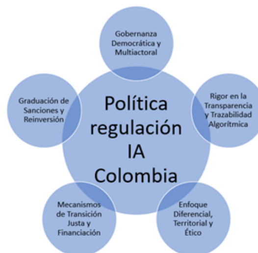
Figure 4. Recommendations to strengthen AI policy in Colombia.

Taking into account the need to reconcile innovation with the protection of rights and the lessons drawn from international models, Figure 4 proposes a set of recommendations to strengthen AI policy in Colombia: